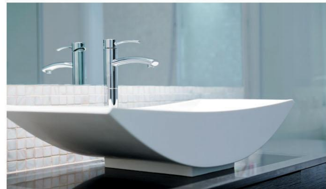
Premium CP Fittings