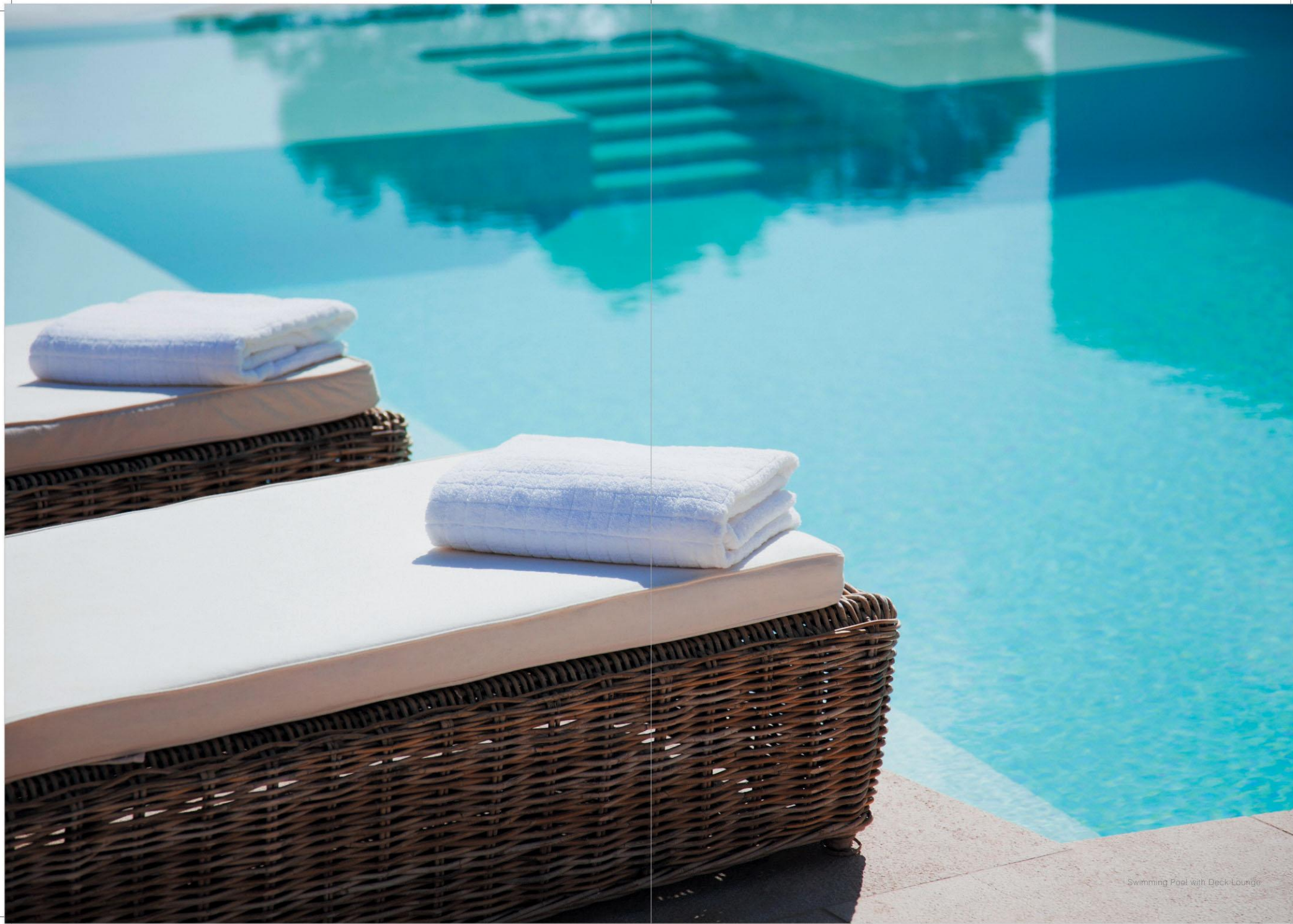
Swimming Pool with Deck Lounge