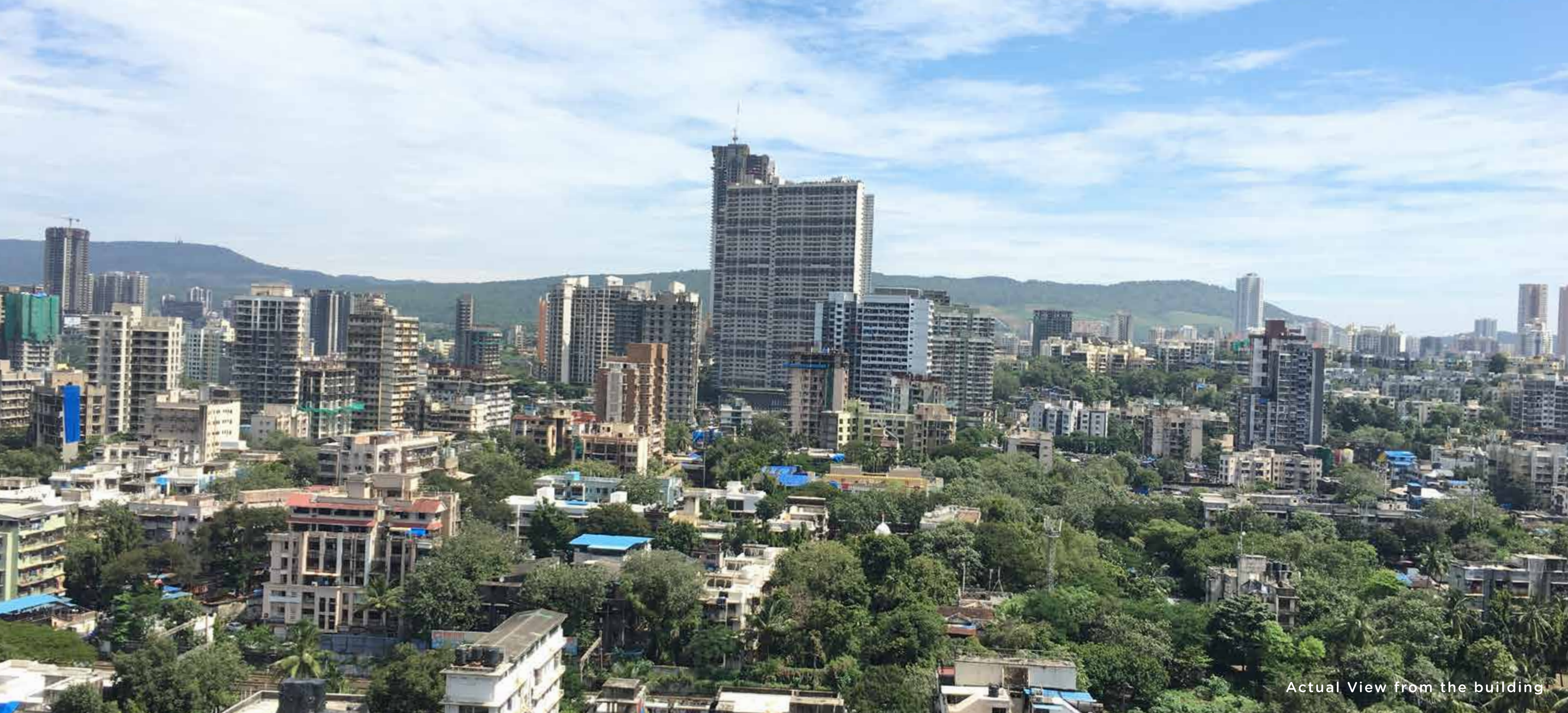
Actual View from the building