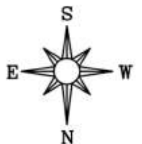
4th PODIUM FOOR PLAN