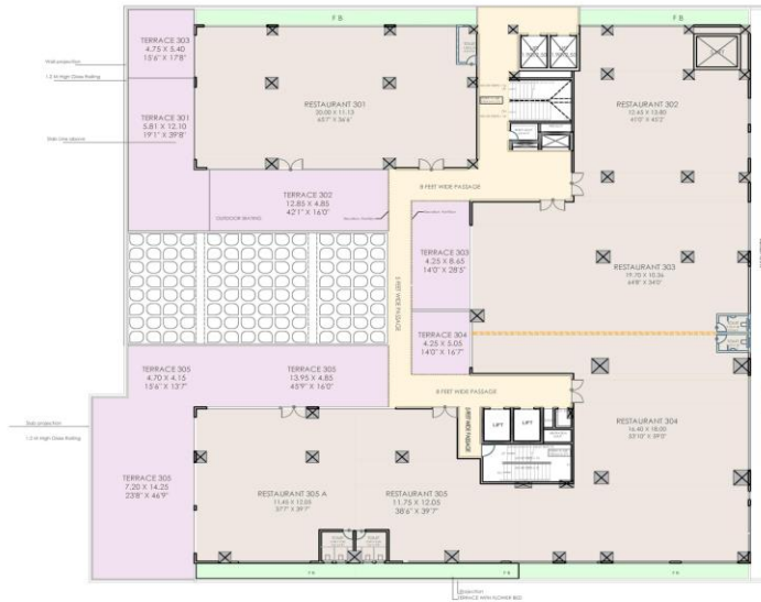
THIRD FLOOR LEVEL - RESTAURANTS