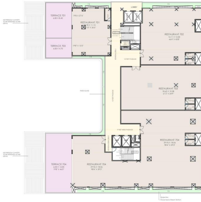
SEVENTH FLOOR LEVEL - RESTAURANT