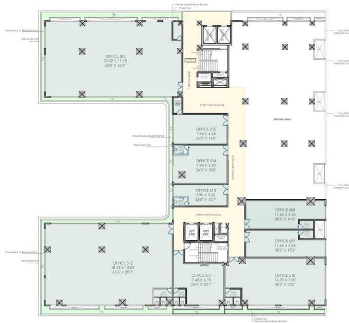
FIFTH FLOOR LEVEL - OFFICES