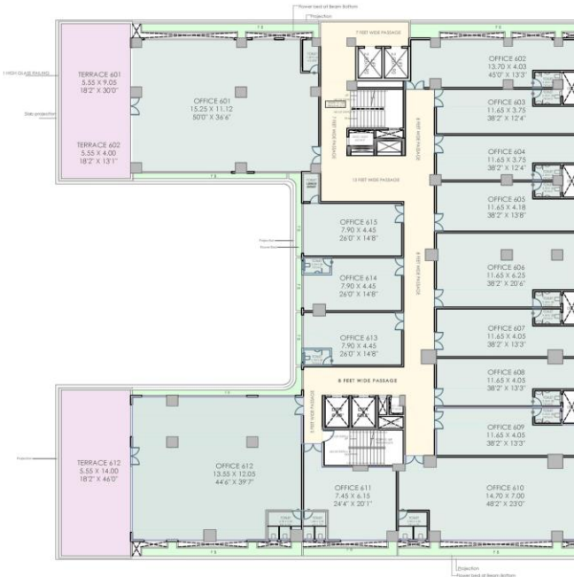
SIXTH FLOOR LEVEL - OFFICES