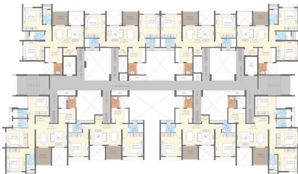
'A' BLDG_2ND,4TH,6TH,8TH,10TH,12TH & 14TH FLOOR PLAN