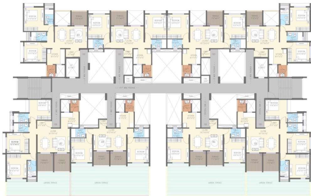
'A' BLDG_1st FLOOR PLAN