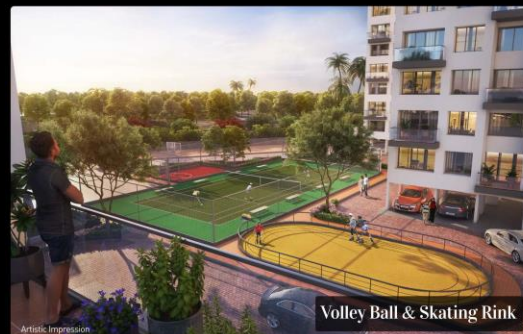
Volley Ball & Skating Rink