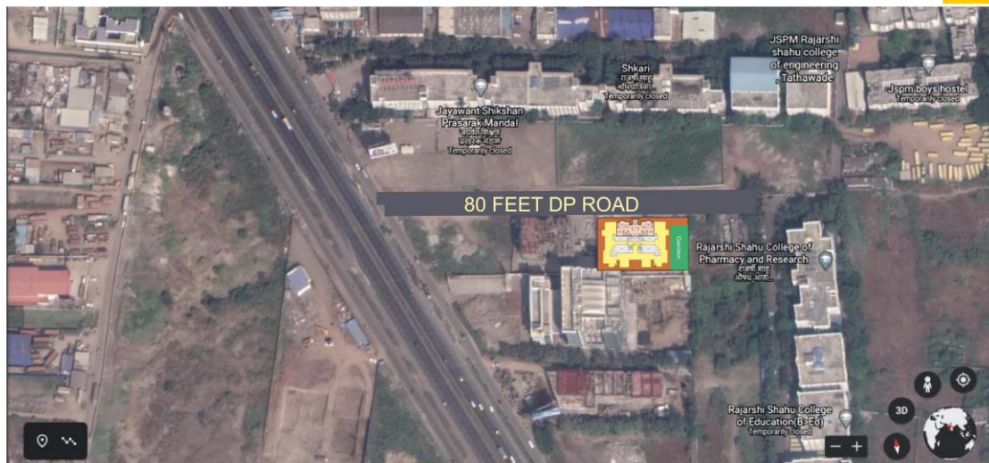
Image Created from Google Maps