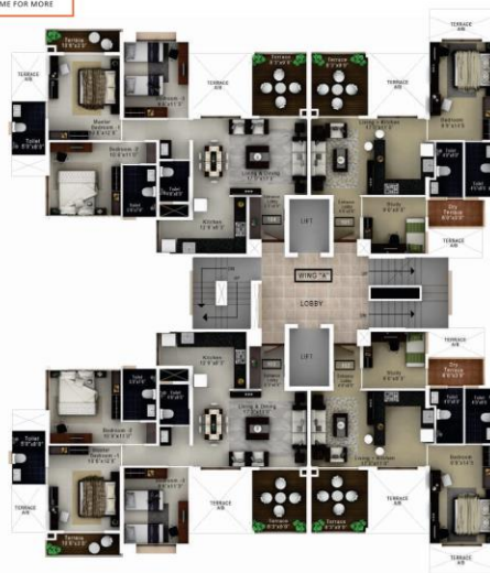
1ST FLOOR LAYOUT WING A