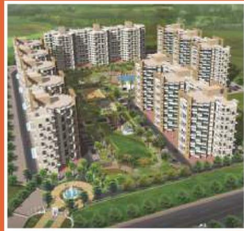
MSR QUEENSTOWN, CHINCHWAD

Mind Space Realty offers spaces that are designed with perfection and keeping every detail in mind. Every space is planned in a unique way, ensuring you are offered the maximum functionality. Its ambitious vision has helped them achieve architectural brilliance in their projects like MSR Queenstown in Chinchwad, MSR Olive in Katraj, MSR Capital in Pimpri, MSR Square in Chinchwad.