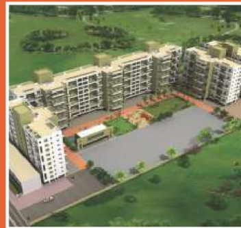
MSR OLIVE, KATRAJ