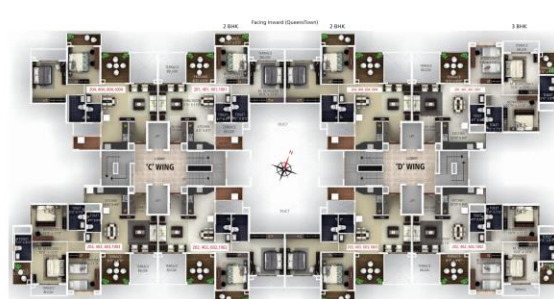
TYPICAL ODD FLOOR PLAN 1st, 3rd, 5th, 7th, 9th, 11th