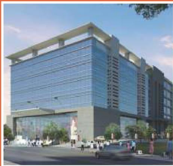
MSR CAPITAL, PIMPRI