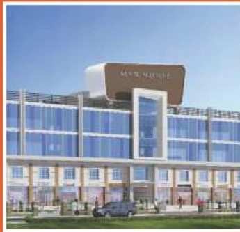
MSR SQUARE, CHINCHWAD