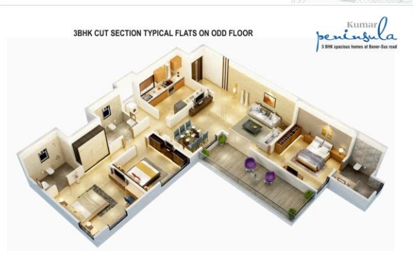
3BHK CUT SECTION TYPICAL FLATS ON ODD FLOOR

Kumar peninsula 3 BHK spacious homes at Banner-Goa road