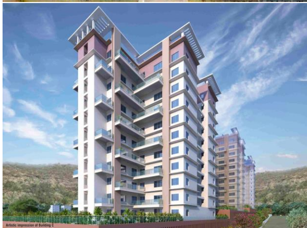
Artistic impression of Building