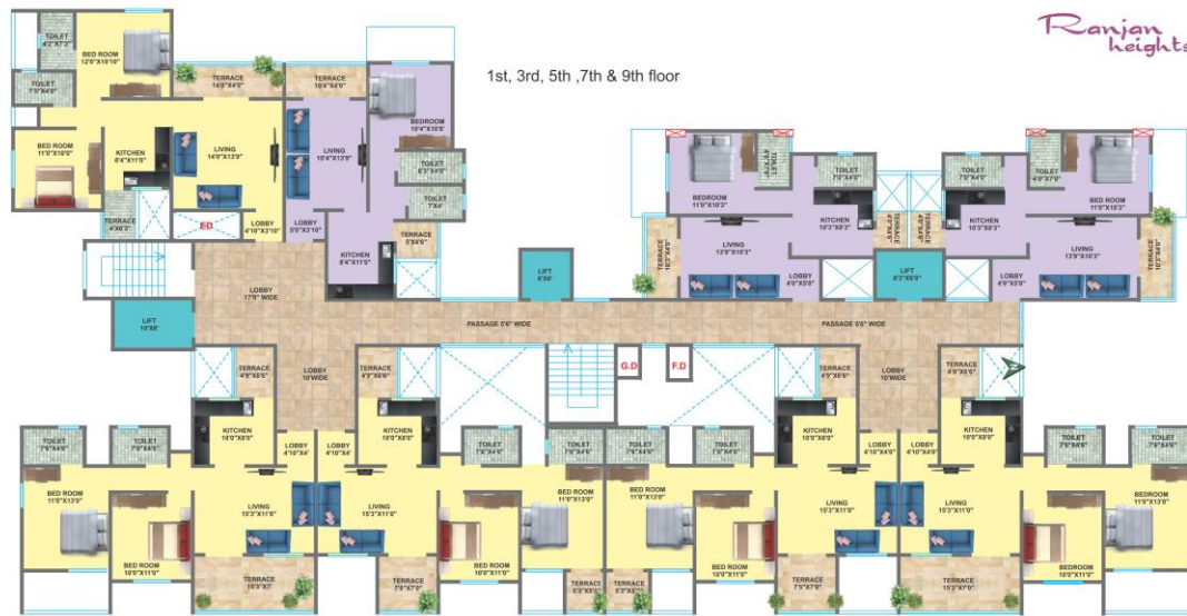
Wing B - Third, Fifth, Ninth Floor