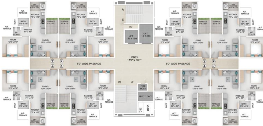
WATERLILY (3 rd , 5 th , 7 th , 9 th , 11 th Floor)