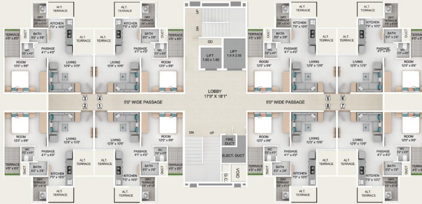
WATERLILY (2 nd , 4 th , 6 th , 10 th Floor)