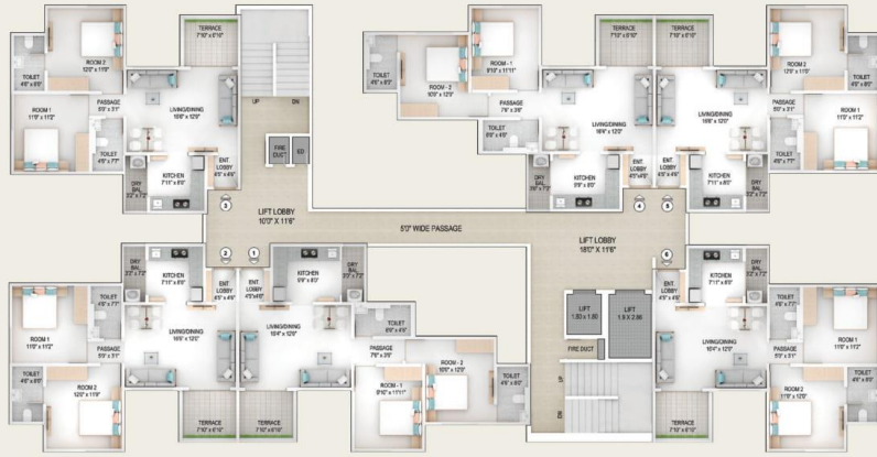
WATERMEADOW (2 nd , 4 th , 6 th , 10 th Floor)