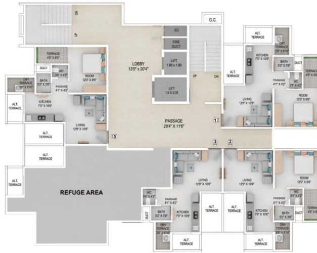
WOODS (8 th Floor)