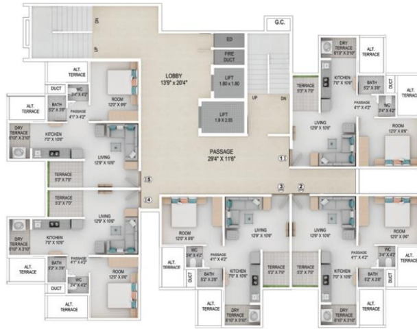
WOODS (1 st , 3 rd , 5 th , 7 th , 9 th , 11 th Floor)