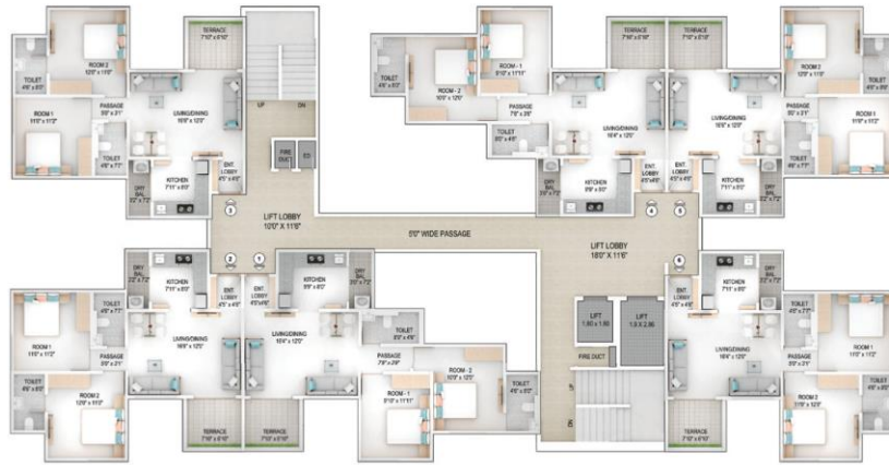
WATERMEADOW (2 nd , 4 th , 6 th , 10 th Floor)