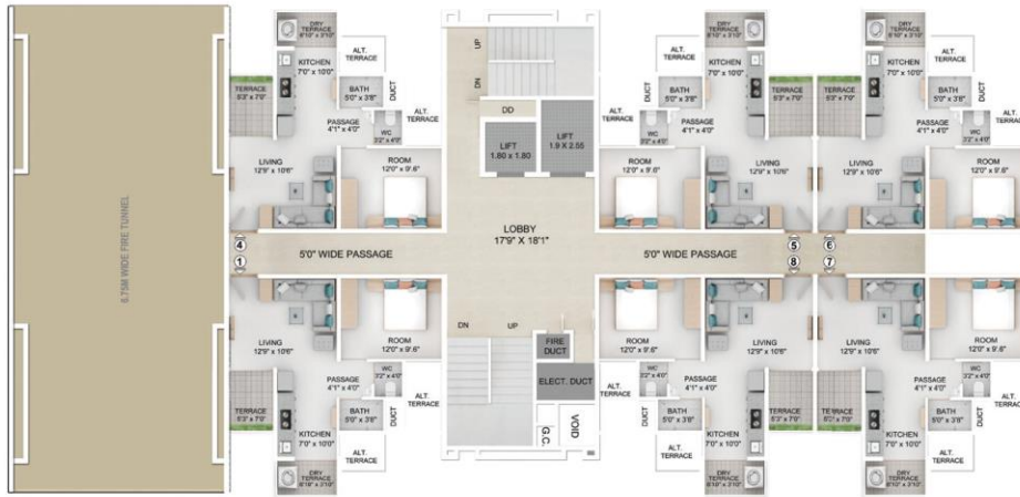
WATERLILY (1 st Floor)