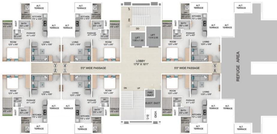
WATERLILY (8 th Floor)