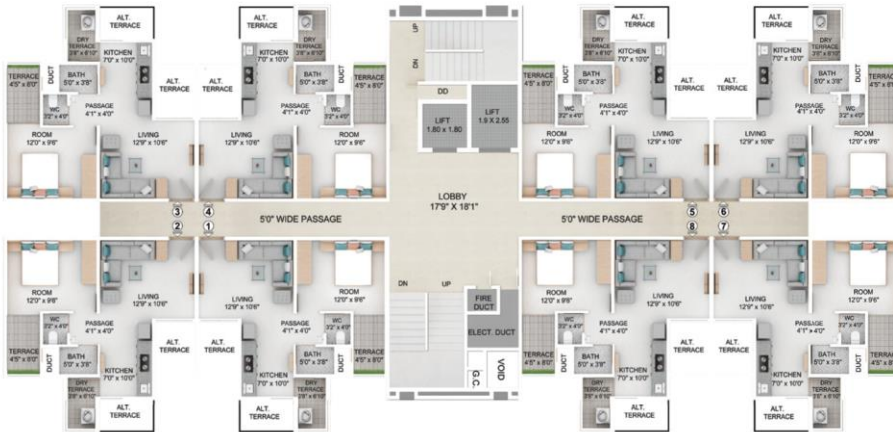
WATERLILY (2 nd , 4 th , 6 th , 10 th Floor)