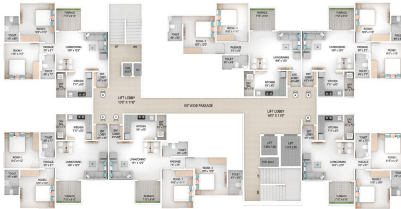
WATERMEADOW (1 st , 3 rd , 5 th , 7 th , 9 th , 11 th Floor)