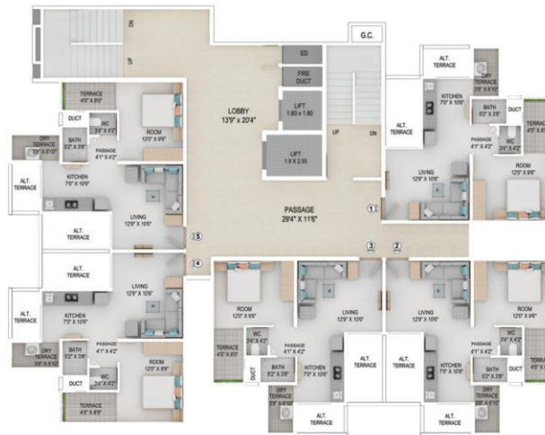
WOODS (2 nd , 4 th , 6 th , 10 th Floor)