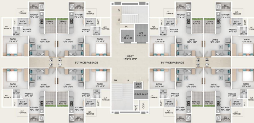
WATERLILY (3 rd , 5 th , 7 th , 9 th , 11 th Floor)