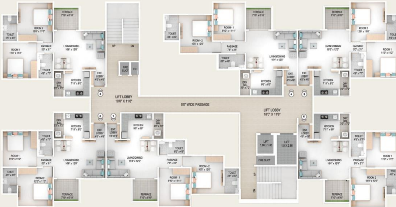
WATERMEADOW (1 st , 3 rd , 5 th , 7 th , 9 th , 11 th Floor)