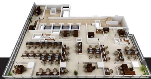
4TH FLOOR OFFICE AREA