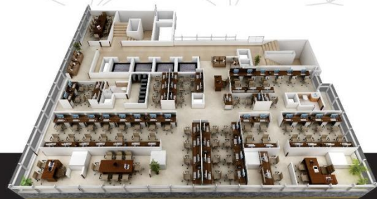
5TH FLOOR OFFICE AREA