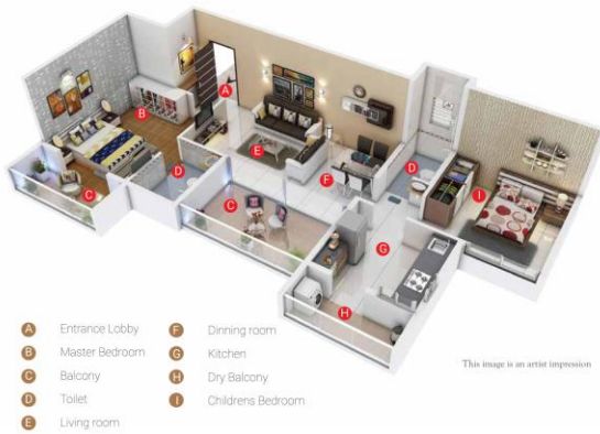
This image is an artist impression