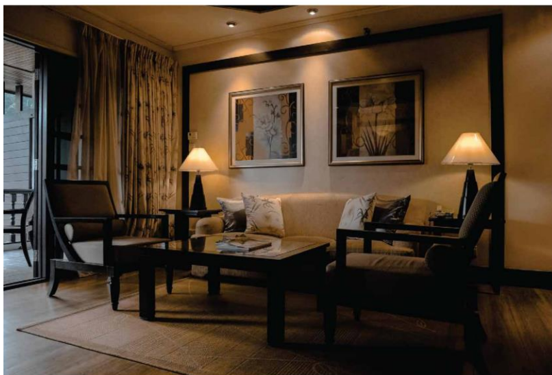
This image is an artist impression