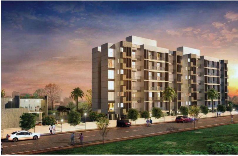
This image is an artist impression