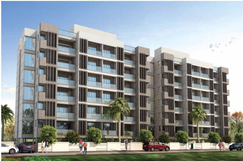
This image is an artist impression