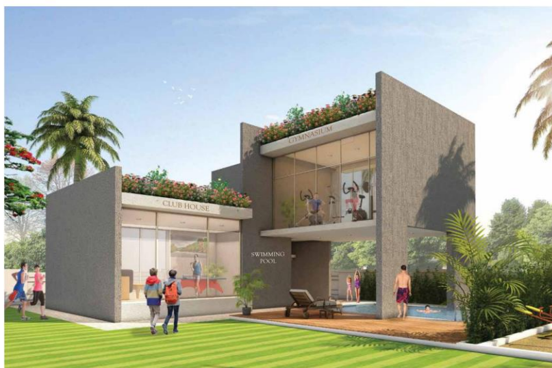
This image is an artist impression