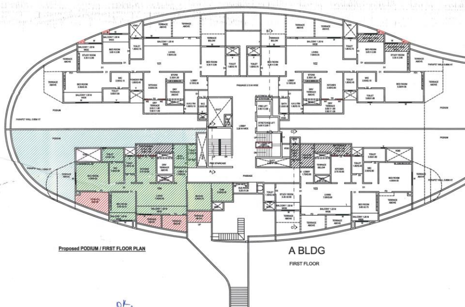
Proposed PODIUM / FIRST FLOOR