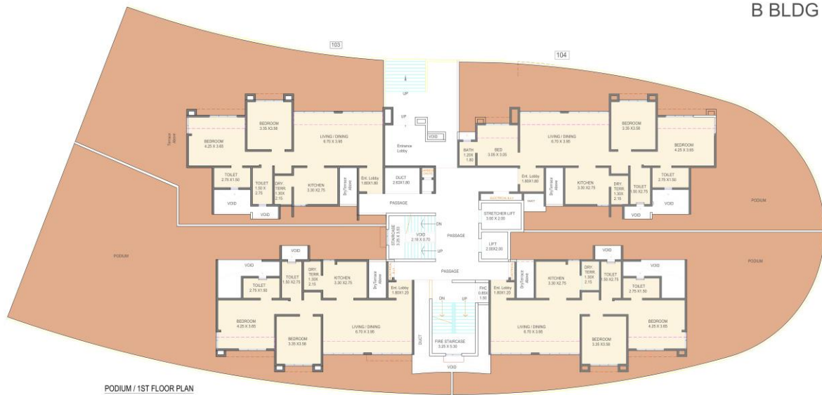
PODIUM / 1ST FLOOR PLAN