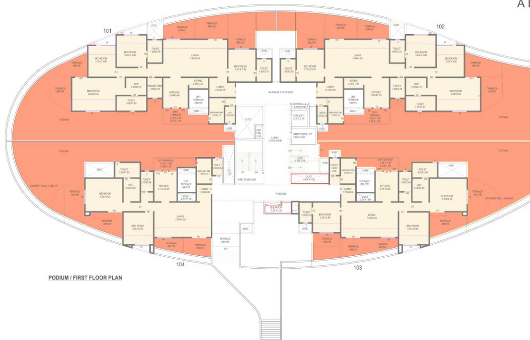
PODIUM / FIRST FLOOR PLAN