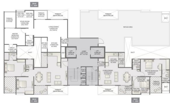
AREA STATEMENT (AS PER MAHARERA ACT)