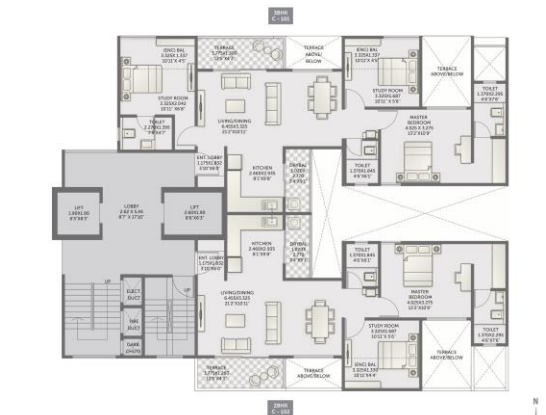
AREA STATEMENT (AS PER MAHARERA ACT)