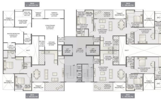
AREA STATEMENT (AS PER MAHARERA ACT)