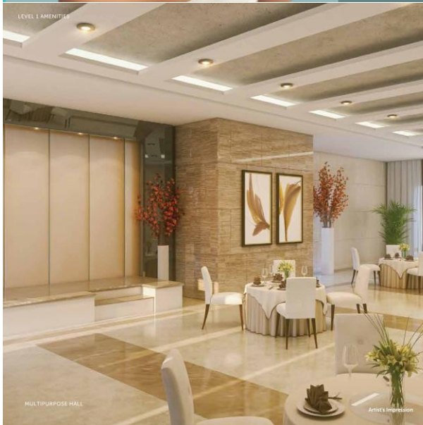
LEVEL 1 AMENITIES