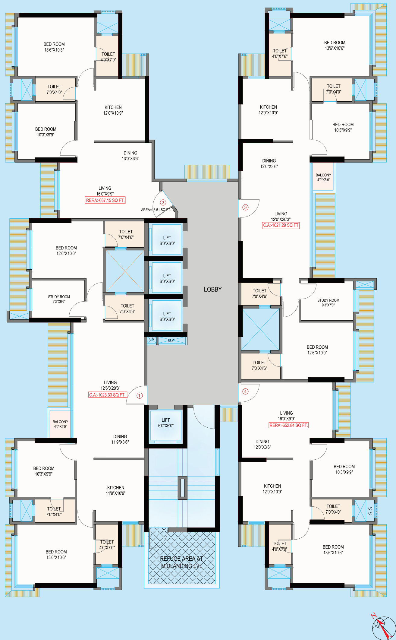
1ST TO 14TH FLOOR PLAN